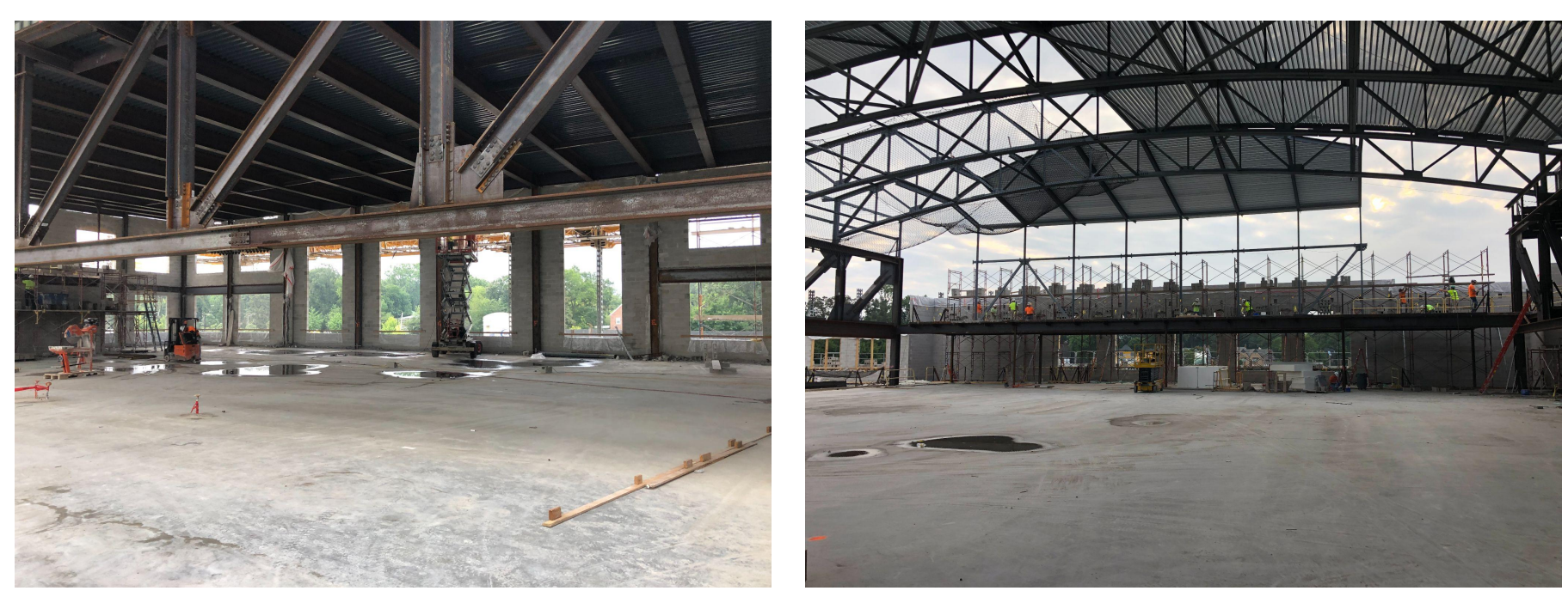
Competition Court looking East